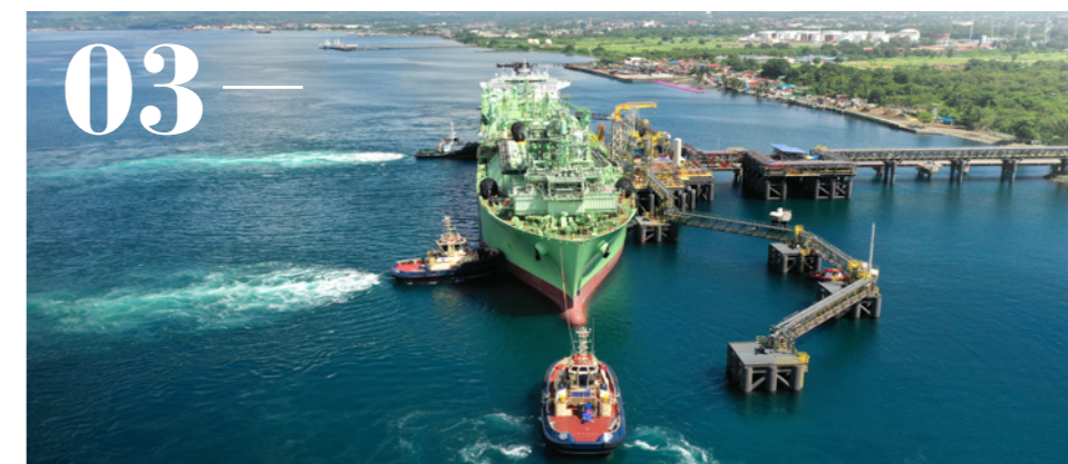
BW LNG: Freedom from the pipeline