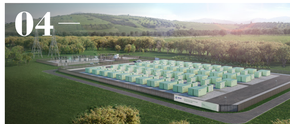
BW ESS: Charging ahead in Europe and Australia