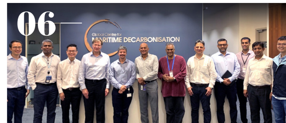
Four steps towards a low-carbon future