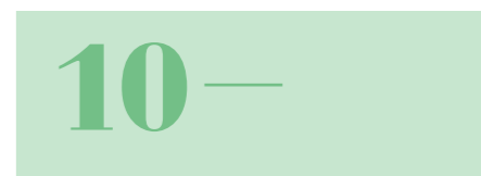
People & culture