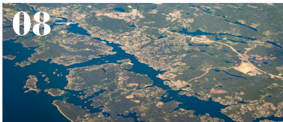
Connecting sea to shore