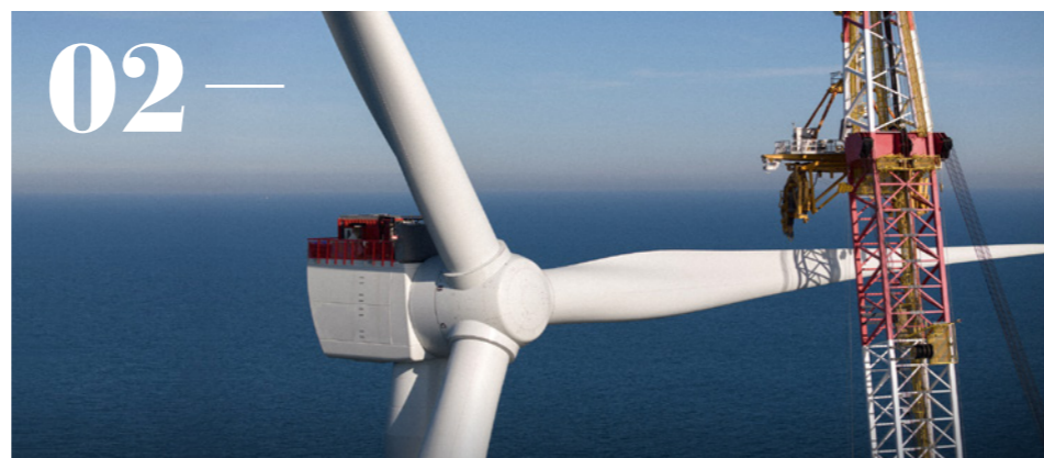
New York, New York: Three BW affiliates announce US listings