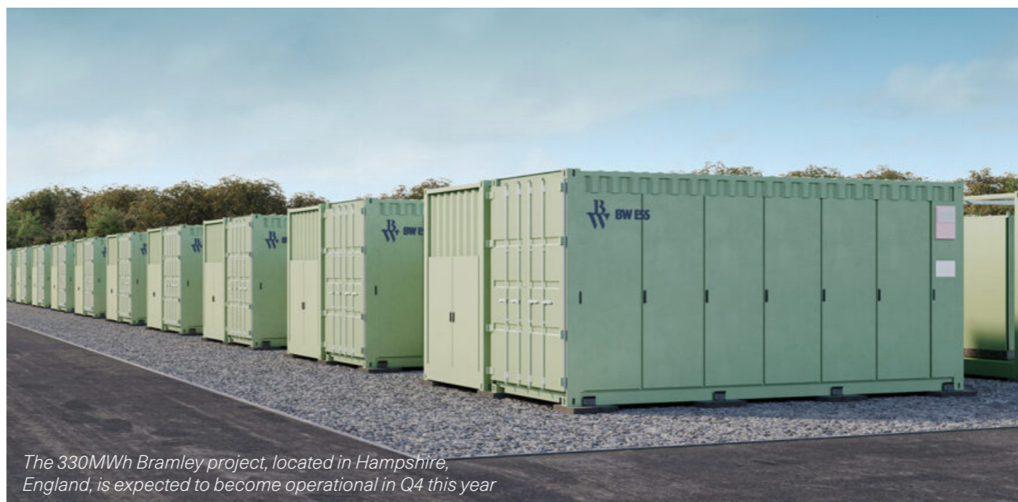
The 330MWh Bramley project, located in Hampshire, England, is expected to become operational in Q4 this year