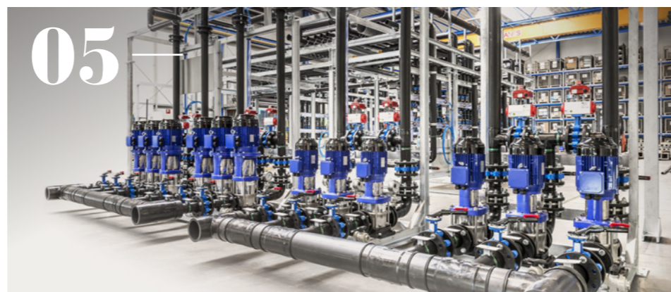
BW Water: Turning up the deal flow